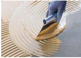
Picture 1. Trowel spread