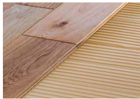
Picture 2. Plank bonding.