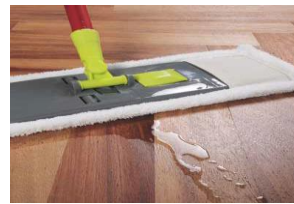
Picture 3. Clean spills promptly.

Disclaimer: Preference Floors has used its reasonable endeavors to ensure the accuracy and reliability of the information contained herein and, to the extent permitted by law, will not be liable for any inaccuracies, omissions or errors in this information nor for any actions taken in reliance on this information. Products must be installed in accordance with relevant installation recommendations and industry best practices.